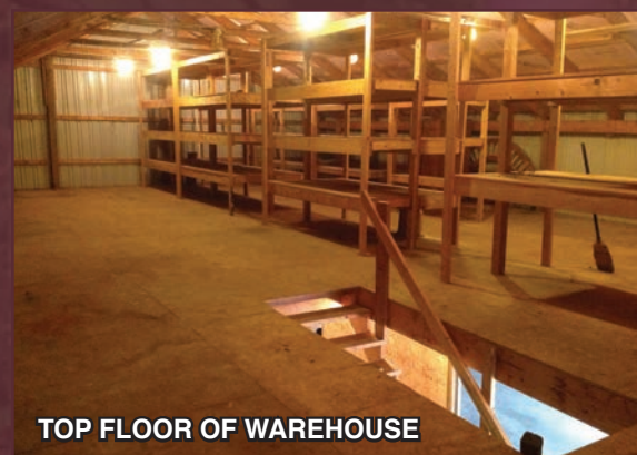
TOP FLOOR OF WAREHOUSE