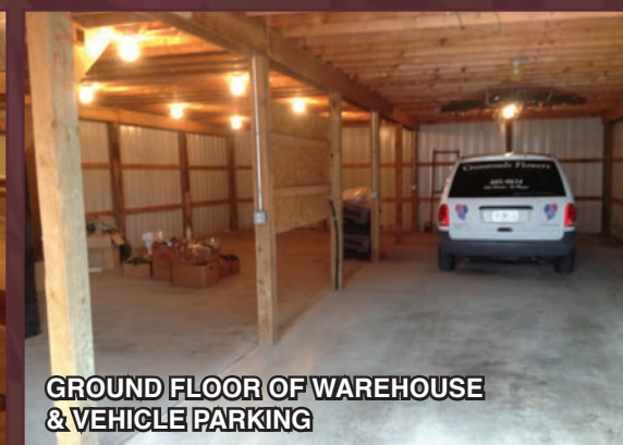
GROUND FLOOR OF WAREHOUSE & VEHICLE PARKING

Someone once said: All good things come to an end. After 52 years and three generations of serving northeast Allen County and Fort Wayne, Crossroads Flowers will close their doors forever.