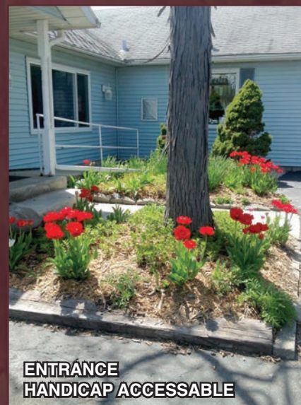
ENTRANCE HANDICAP ACCESSIBLE