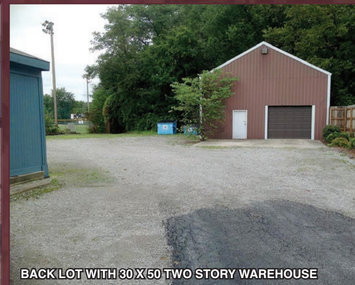
BACK LOT WITH 30 X 50 TWO STORY WAREHOUSE