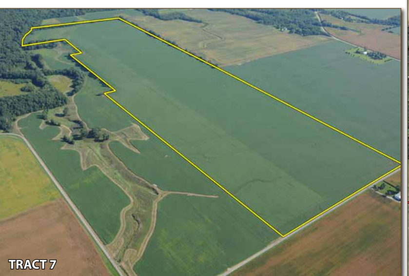
FARM #E - VERMILION COUNTY, IL GPS Coordinates: 40°17'7.28"N, 87°49'5.93"W

TRACT 6: 68± acres with approximately 56 acres tillable (FSA), and border of an open ditch. Road frontage on CR 300 N. Primarily Bryce and Rutland soils.