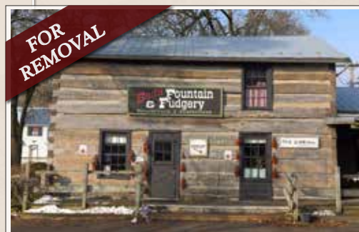
TRACT 14: Soda & Fudge Shop Building

Meet a Schrader representative at the Round Barn Theatre building.