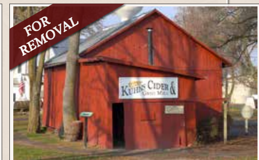
TRACT 16: Cider & Grist Mill Building

TRACT 9: 2.5± acres including the large storage building and access from US 6. Consider the possibilities of this large 21,450± sq. ft. heated building with loading bays and 18' eaves.