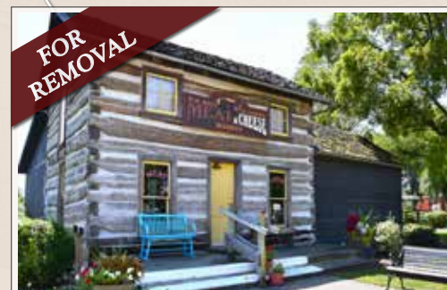
TRACT 15: Meat & Cheese Building